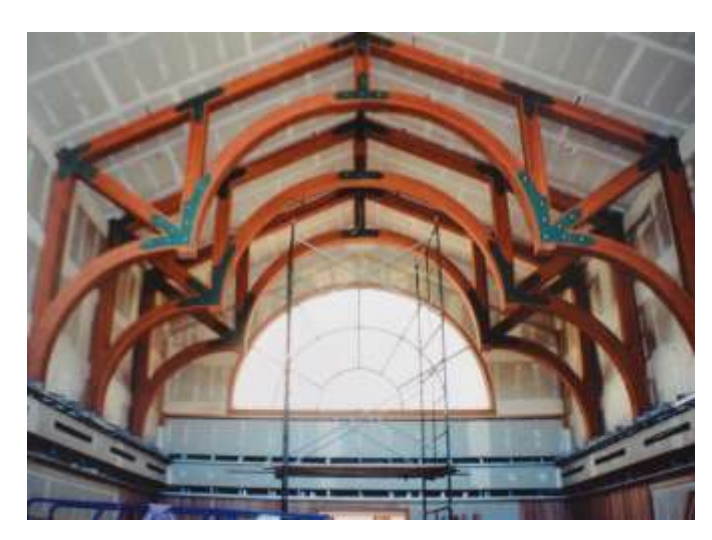
Trusses in the Humboldt Room