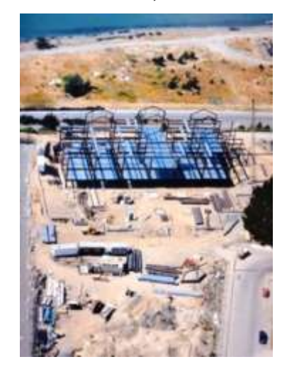
A Bird's Eye View