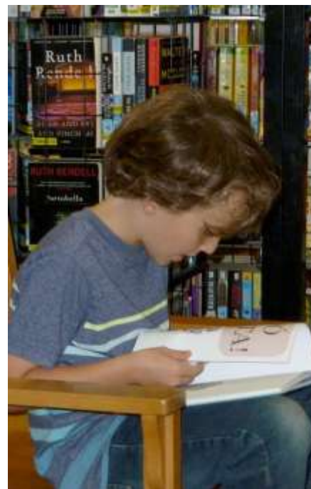
Children Enjoying the Trinidad Library